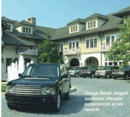
Range Rover staged customer lifestyle experiences at six resorts

"Usually in the past, marketers were leading the consumers. They were driving how they wanted you to think about the brand," says Givner. "And with all this social communication now, the consumers in many cases are ahead of the marketers." ■